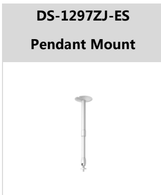
DS-1297ZJ-ES Pendant Mount